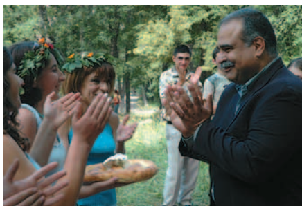
Mr. Raffi Hovannisian visiting the children at camp.