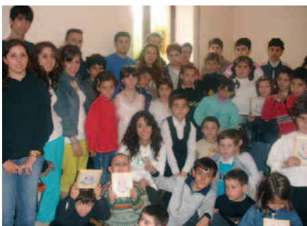
Students of Alex Pilibos Armenian School of Los Angeles meeting their friends at Orran.