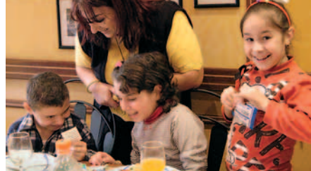
A great meal and gifts by Tifozi brings a big smile.