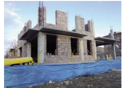
The second floor near completion

Visitors to the Orran center in Yerevan are so impressed with the warm haven it has become for the battered children and elderly of Armenia. Be assured that the Orran Krikorian Center in Vanadzor will fill the same urgent need. Please consider having a room named after your loved one and think of the happiness, the laughter and the illumination those walls will give to so many children of our homeland.