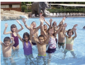
Having fun at the Water World