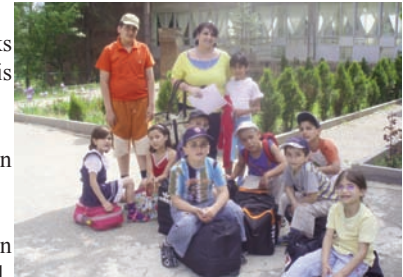
Orran children at the "Our Lady of Armenia" camp