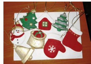
Pottery Christmas Decorations

Orran children were among the gourmands tasting the largest strudel of the Caucasus (36 metres long), organized by the Armenia Marriott Hotel and Austrian Airlines. In addition to enjoying the strudel, the children received lovely presents from Austrian Airlines.