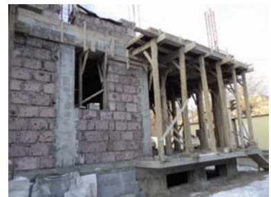
Construction in progress

We would like to thank our Principal Benefactors for the period of December 2010 - 2011